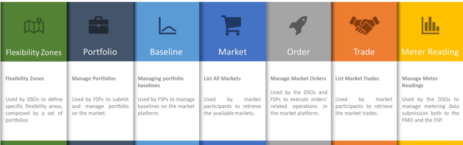
Fig. 1 - UMEI API Groups